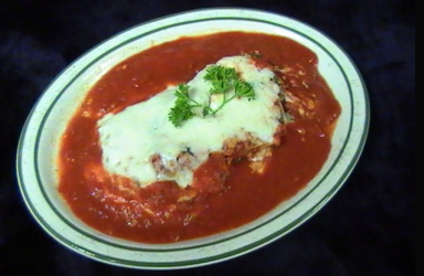
Veal : $ 17.99

Extras: Marinara sauce $ 0.75 Two meatballs $ 1.75 (3) Shrimps Market price.