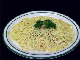
Spaghetti Aglio e Olio Spaghetti sautéed with fresh garlic, crush red pepper and olive oil. $10.99