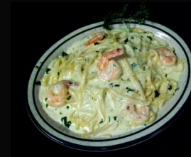
Fettuccini Alfredo con Gamberi Our homemade Alfredo sauce Topped with shrimps over fettuccini. MARKET PRICE