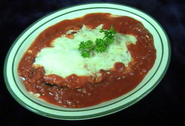
Chicken : $ 14.99