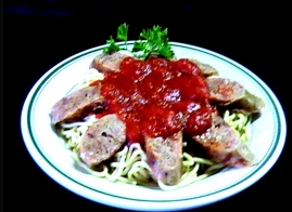
Spaghetti con Salsicce Spaghetti with our homemade marinara sauce topped with our mild Italian sausage. $12.99