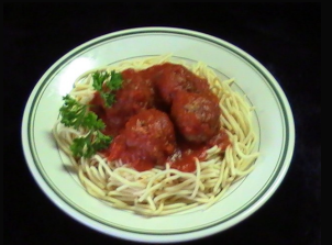
Spaghetti with Meatballs Spaghetti with our homemade marinara sauce topped with our delicious meatballs. $12.99