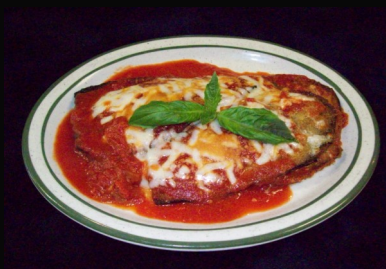
Eggplant : $ 14.99

We start with fresh cutlets battered in our Italian seasoned bread crumbs quickly fried, then smothered with our delicious marinara sauce. Topped with mozzarella cheese and baked to perfection in the oven.