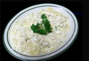
Fettuccine Alfredo con Pollo Our homemade Alfredo sauce with chicken breast over fettuccini. $14.99